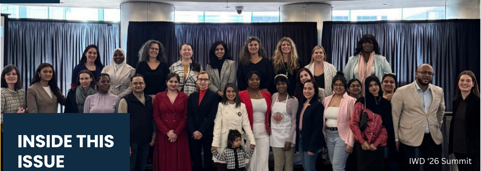
IWD '26 Summit